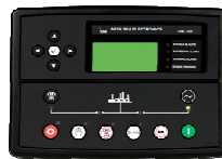
DSE-7320 Remote Control Panel